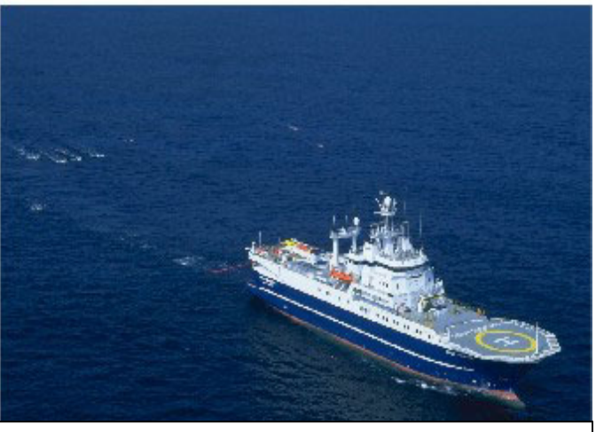
Seismic surveying. Note towed airgun array.

Seismic-surveying involves synchronized firing of a towed airgun array. Airguns fire quantities of highpressure (approximately 2000psi) air vertically into the water, directing 10Hz-300Hz (low-frequency) impulsive sounds toward the sea floor so that sound waves penetrate the geology and reflect back to sensors (Lissner and Greene 1998). Analysis of received echoes provides sub-sea geologic imagery, and thus yields information such as the presence of extractable hydrocarbons (oil and natural gas) and tectonic characteristics (WDCS 2003, NRC 2003). Peak source levels for