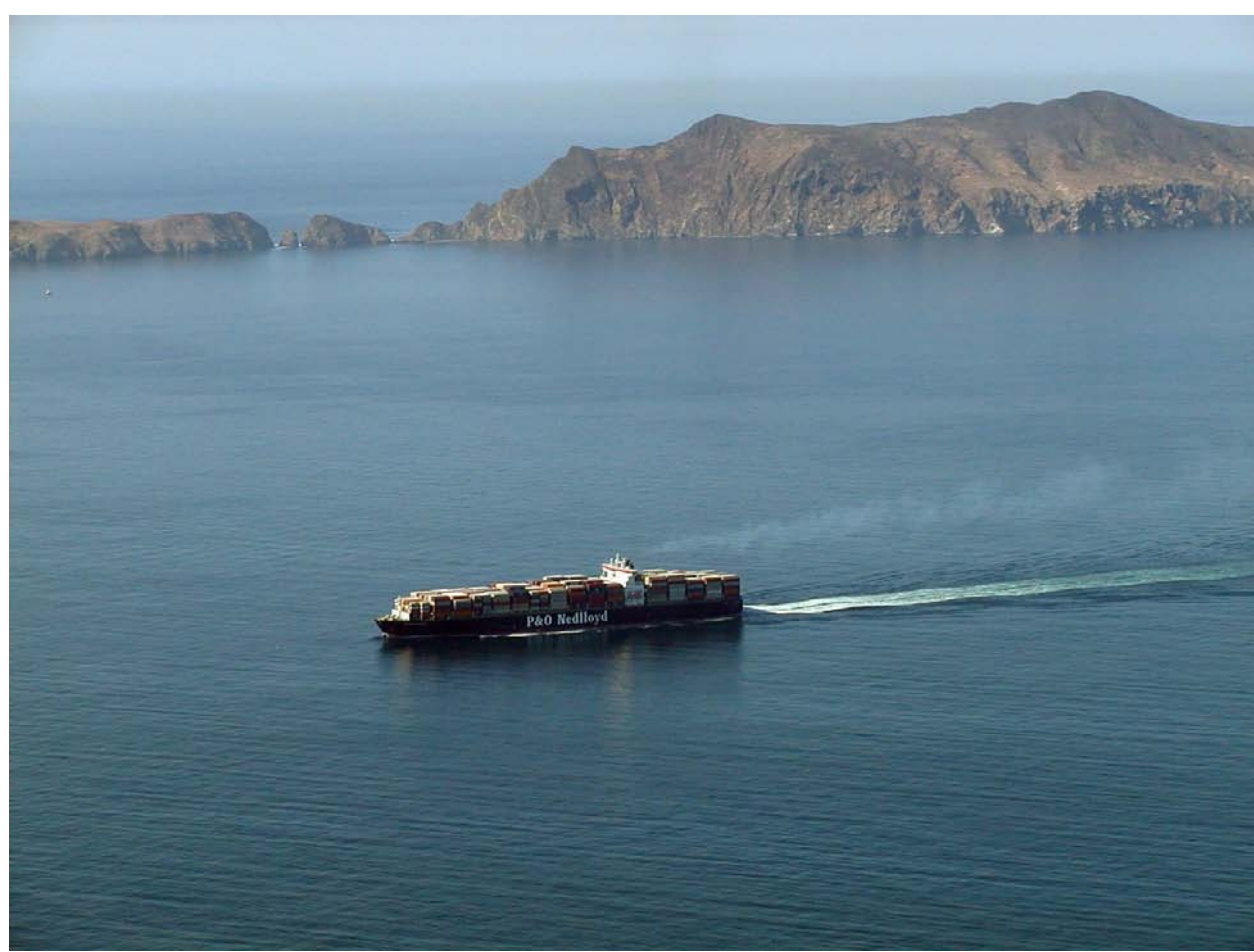
A loaded southbound container ship passing by Anacapa Island.

and anthropogenic noise, and were thus extensively relied upon for the present discussion. Similarly, Marine Mammals and Noise (Richardson et al. 1995) exhaustively gathers and organizes marine mammal bioacoustics science up to its date of publication, and is thus the core text for understanding many fundamentals of the field. These works are recommended for further information on anthropogenic noise and marine ecology.